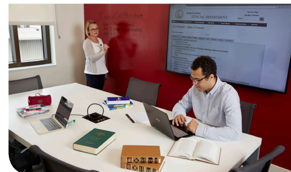
Group study rooms throughout the library are equipped with monitors and dry-erase walls.

Printers are in the Student Commons. Each student is allotted a set number of pages per academic year. When the allotted pages are spent, you must add money to your Carolina Card account. LexisNexis offers free printing of Lexis material to a designated printer in the Commons. A scanner (free) and copier (Carolina Card) are in Room 120A, near the circulation desk.