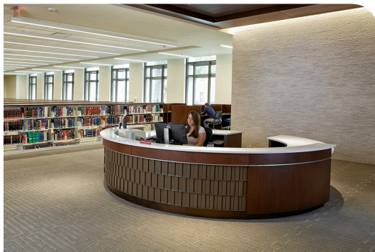
The reference desk is located on the first floor.

At the reference desk, just beyond the library's entrance, reference librarians are on duty Monday - Friday 8:30 a.m. to 5:00 p.m. to help students locate and use legal materials.