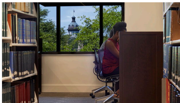
From the library's third floor, there is a perfect view of the South Carolina Statehouse peeking through the trees.